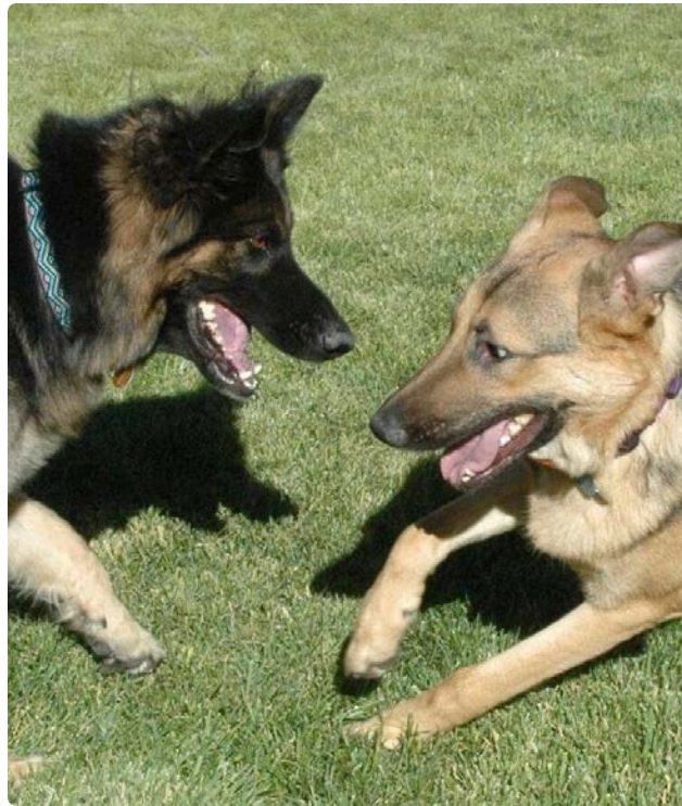
Sunka & Apollo at play.