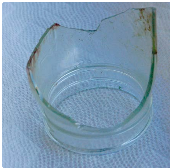
Broken jar that had trapped Tunia

When Tunia was trapped last year many of you helped pay for his medical care through the fundraiser on Go Fund Me. Tunia had been coming to drink at the birdbath in the front yard all summer long in 2023. Then, on the Tuesday before Christmas last year he showed up with a broken glass ball canning jar stuck around his head and neck. He had broken off part of the end so he could breathe.