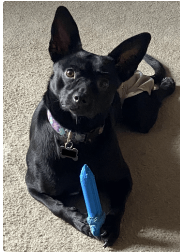
Oreo, special needs Schipperke mix.